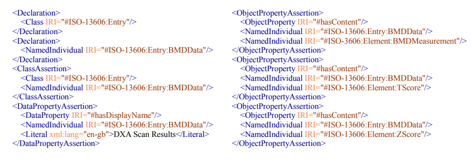
Figure 2. Structured Health Record Using OWL/XML

The ISO 13606 standard specifies a hierarchical context for any clinical data stored in the health record. The data are recorded in Elements which belong to Entries; an Entry is the lowest level of meaningful clinical context (often referred to as a 'clinical statement'). Further context can be provided by organising Entries within Sections, which are collected in Compositions. Generally, the Composition serves as the unit of storage in the EHR but further clinical context can be applied by organising Compositions within Folders. The Folder level organisation can be applied in a dynamic manner, so that a Composition may appear within multiple Folders, simultaneously. So a Folder could represent, for example, the specialty of the clinical user, an episode of care or a long term condition of the patient.